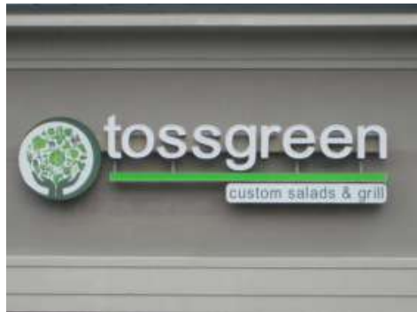
Tossgreen will celebrate its Grand Opening on Tuesday, Jan. 8.

View this blog post on the All-Access Members site